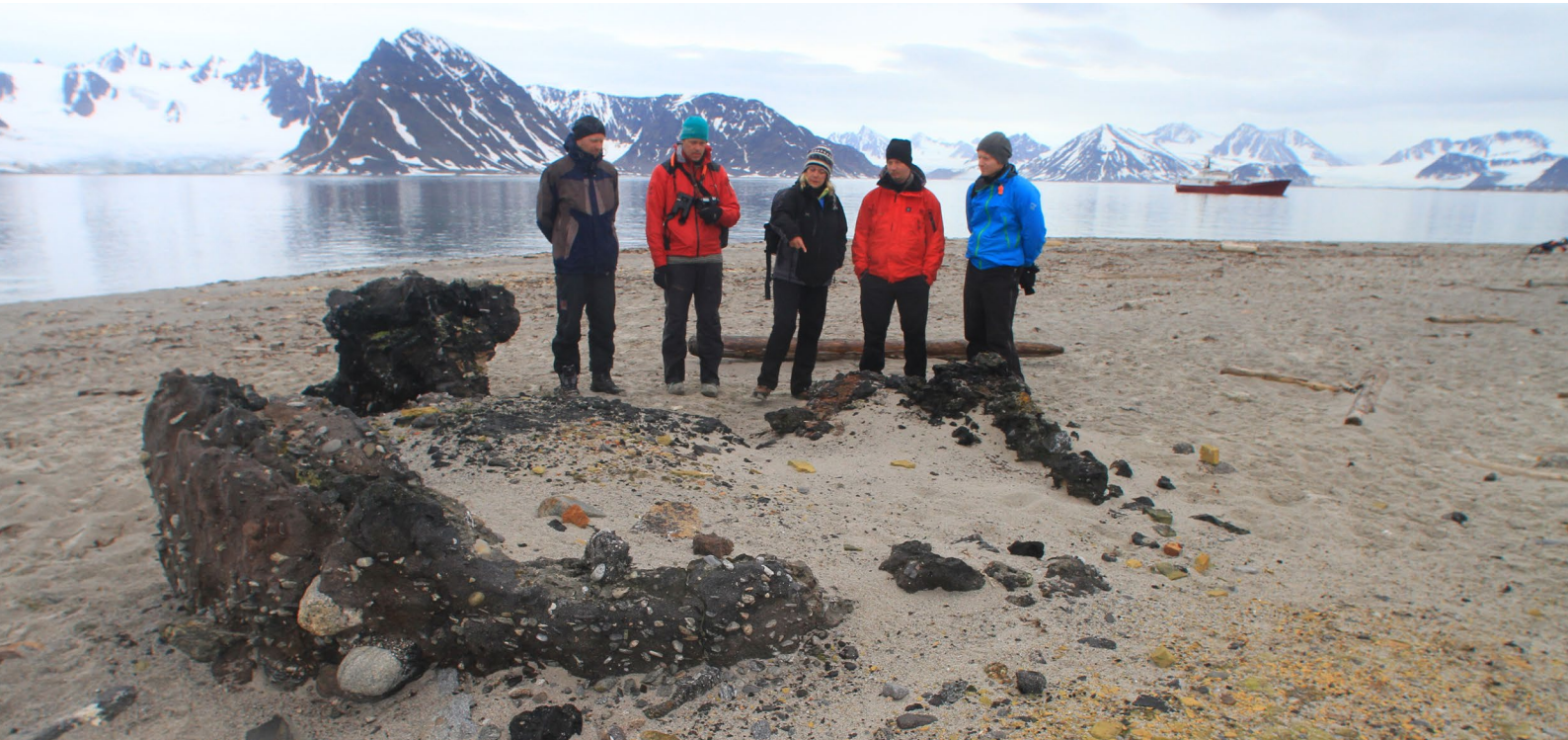
Smeerenburg, Svalbard.

Cultural remains are the traces humans have left behind. They are story-tellers of lived life and past times. Arctic cultural remains often tell stories of challenging life under harsh conditions, where the natural environment and cold temperatures have set the scene. Arctic cultural remains tell many different stories – stories of survival, lost cultures, exploration, science, geopolitics, wars, adventures and much more. While exploring cultural remains, it is important to be careful so that others, including future generations, also have the opportunity to learn from the past.