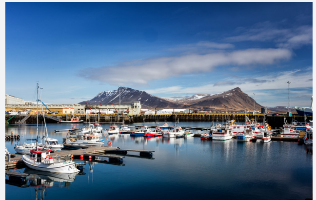
The lively harbour of Akranes. Akrafjall mountain is an impressive landmark for Akranes where it towers over the town.