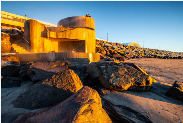
Langisandur beach with the Guðlaug hot pool are popular choices to enjoy the Blue Flag certified shores.