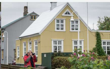
In the center of town, you will find a charming little area that we usually refer to as the "Old Town". Most of the houses there were built in the late 19th century, which is considered very old here in Iceland.