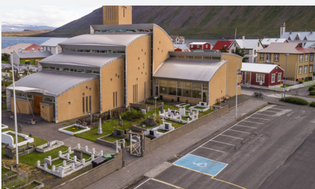
The church is usually open to visitors on weekdays and well worth a visit. Have a look at the altar centerpiece, which consists of 749 clay birds made by the people of the parish.