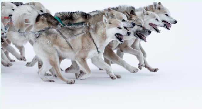
Do not feed or pet the dogs.