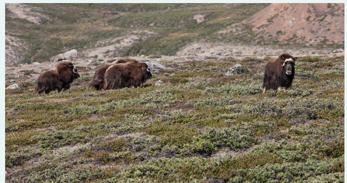
Local wildlife include muskox