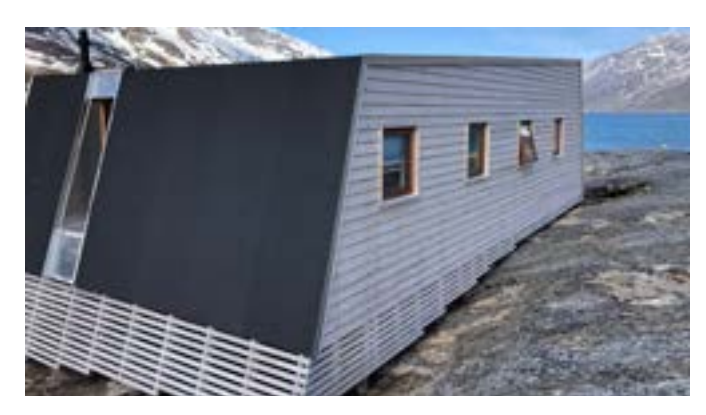
Part of the station used for housing.

Hike to one of the peaks to get great views of the area. Find an orchid – but take only photos. Pick crowberries and bog bilberries in the autumn.