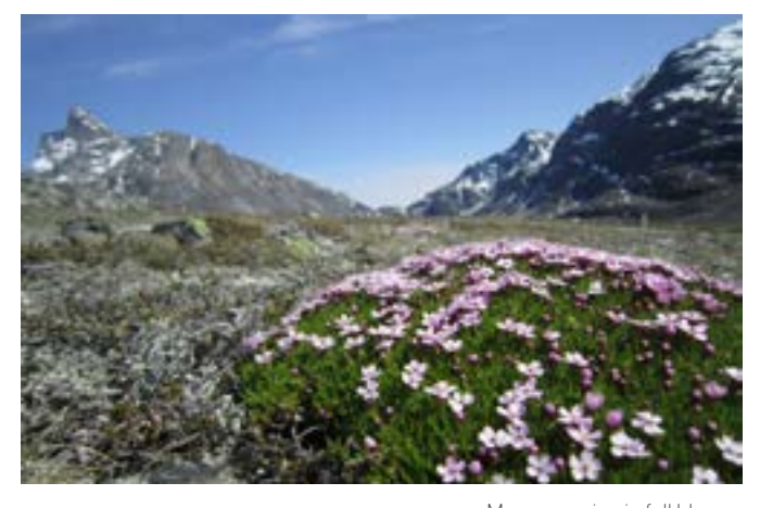
Moss campion in full bloom.

While many parts of Nuup Kangerlua houses vast cultural remains, the area around the station has no registered finds.