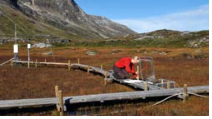
Instrumentation in a fen area.