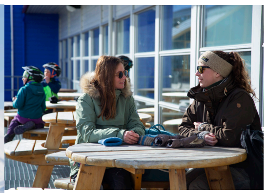
Respect the locals of our little town