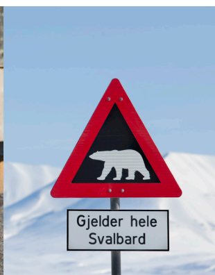
Do not leave town unarmed.