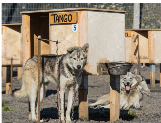
I love food, but do not feed me!